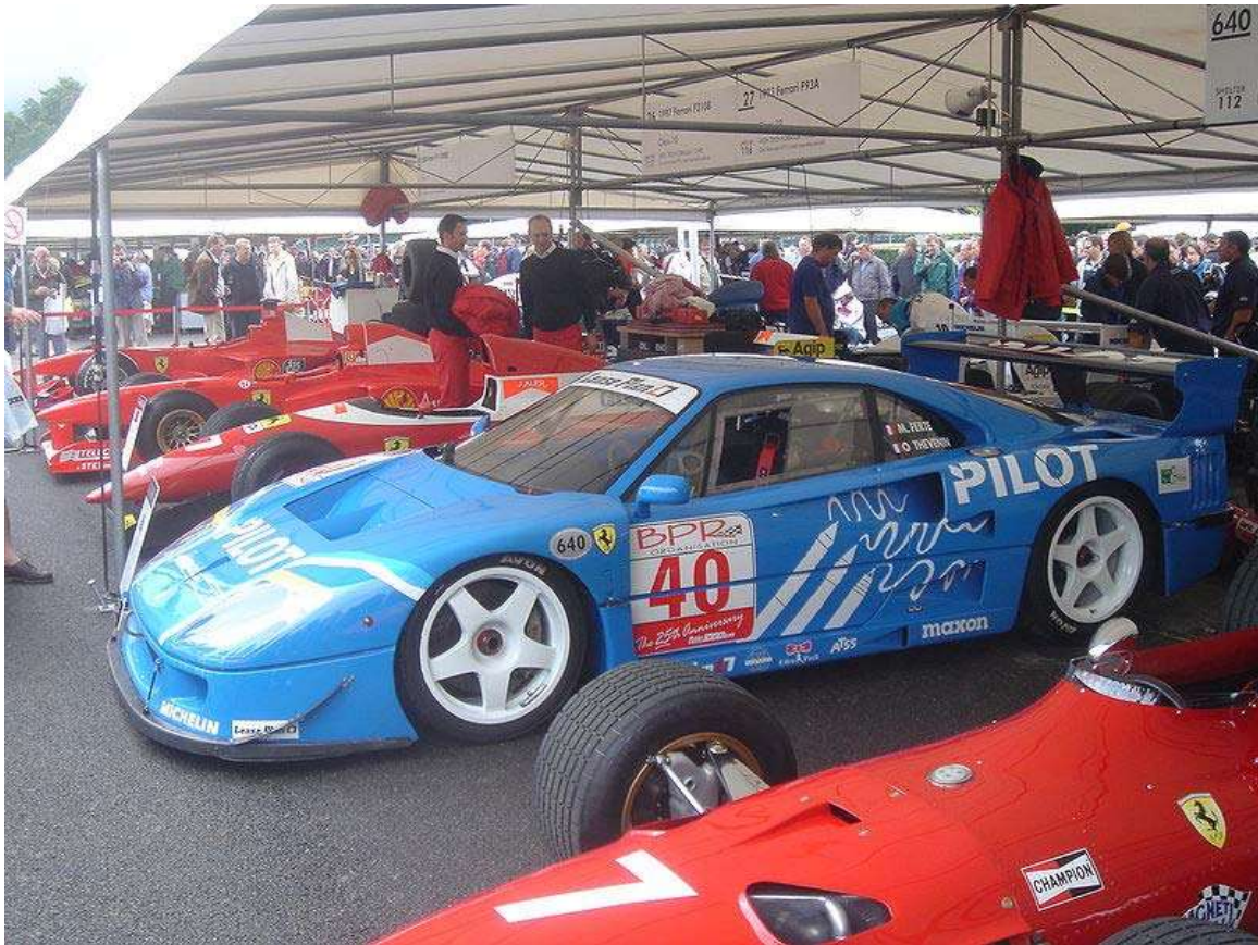
An F40 LM on display at the Goodwood Festival of Speed

The factory never intended to race the F40, but the car saw competition as early as 1989 when it debuted in the Laguna Seca round of the IMSA, appearing in the GTO category, with a LM evolution model driven by Jean Alesi, finishing third to the two faster spaceframed four wheel drive Audi 90 and beating a host of other factory backed spaceframe specials that dominated the races. Despite lack of factory backing, the car would soon have another successful season there under a host of guest drivers such as Jean-Pierre Jabouille, Jacques Laffite and Hurley Haywood taking a total of three second places and one third.