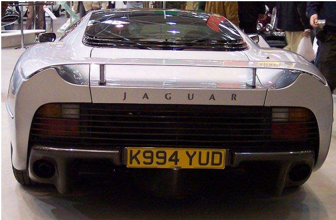
View of the XJ220 from behind

With the promise of four wheel drive and a 500bhp Jaguar V12 this sounded like a dream come true for enthusiasts and speculators alike. Unfortunately, when production finally began in the early 90s, the boom had gone and Group B (for which the XJ220 was originally conceived) had disappeared. Not only this but Jaguar had made the bizarre decision to ditch the 4wd and replace the V12 engine for a Turbo V6. This led to disgruntled customers, many of whom launched court cases against Jaguar, only to lose, and ultimately unsold 220s.