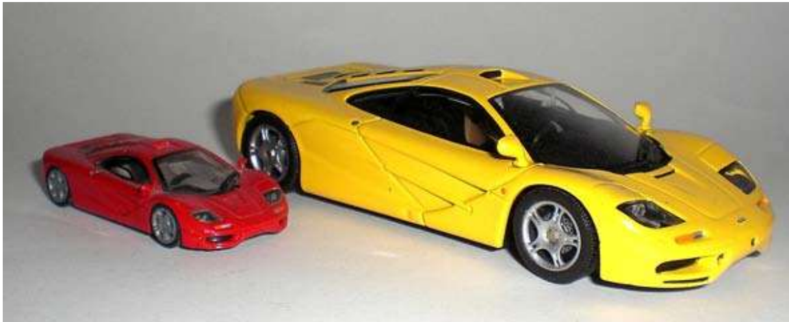
1:87th and 1:43rd models by Minichamps/PMA.

Kit car builder DDR Motorsport builds a kit that resembles the F1, based on the Toyota MR-2 SW20 Turbo.