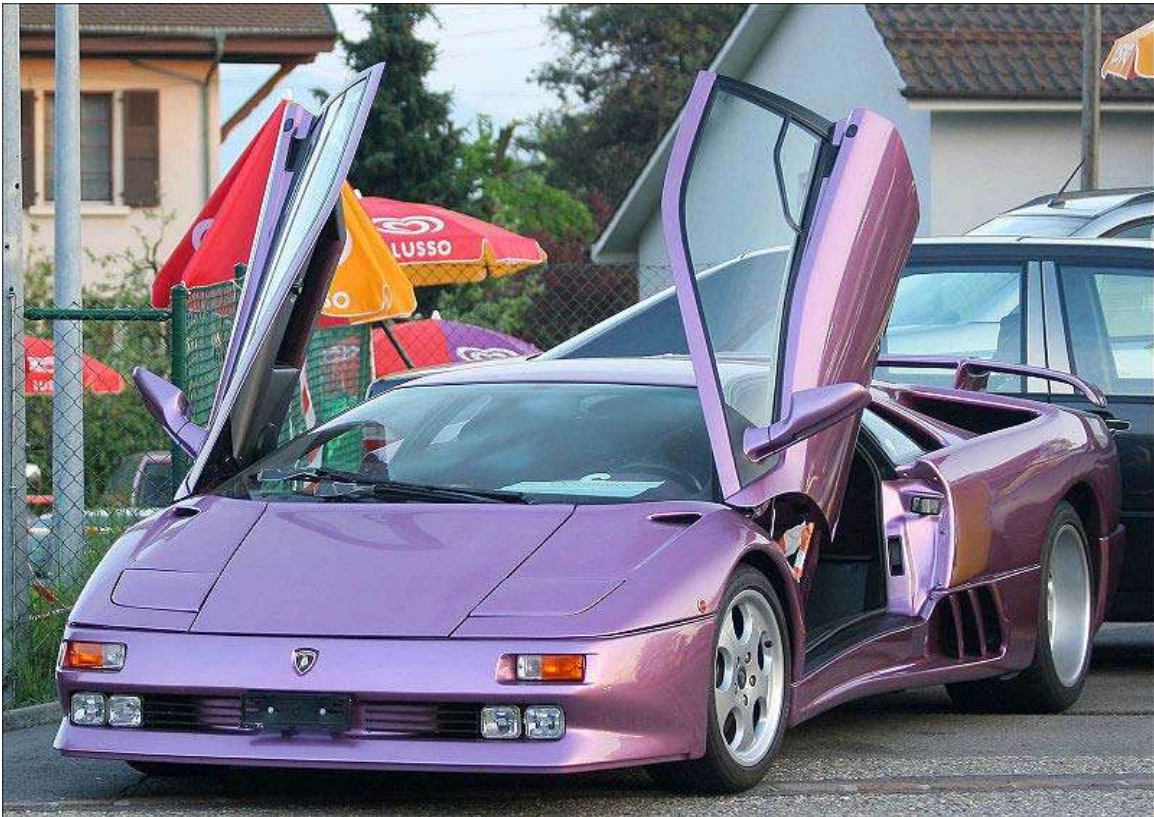
A Diablo SE30

The Diablo SE30 was introduced in 1994 as a limited-production special model to commemorate the company's 30th anniversary. The car was designed largely as a street-legal race vehicle that was lighter and more powerful than the standard Diablo. The engine received a healthy boost to 533 PS (392 kW; 526 hp) by means of a tuned fuel system, freer-flowing exhaust, and magnesium intake manifolds. The car remained rear-wheel drive to save weight, and omitted the electrically-adjustable shock absorbers of the VT model, but it was equipped with adjustable-stiffness anti-roll bars which could be controlled from the interior, on the fly.