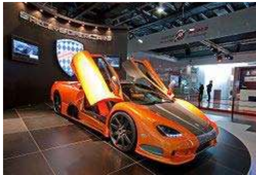
2010 Ultimate Aero at Dubai International Motor Show 2009