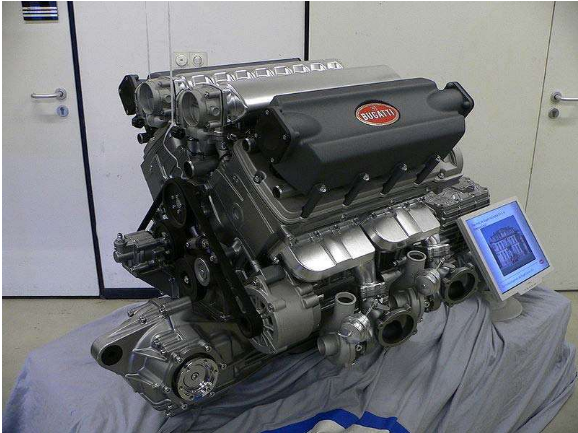
The Veyron's quad-turbocharged W16 engine

The Veyron features an 8.0 litre W16 engine with sixteen cylinders in four banks of four, equivalent to two narrow-angle V8 engines mated in a W configuration. Each cylinder has four valves for a total of sixty four, but the narrow staggered eight configuration allows two overhead camshafts to drive two banks of cylinders so only four camshafts are needed. The engine is fed by four turbochargers and displaces 7,993 cubic centimetres (487.8 cu in), with a square 86 by 86 mm (3.4 by 3.4 in) bore and stroke.