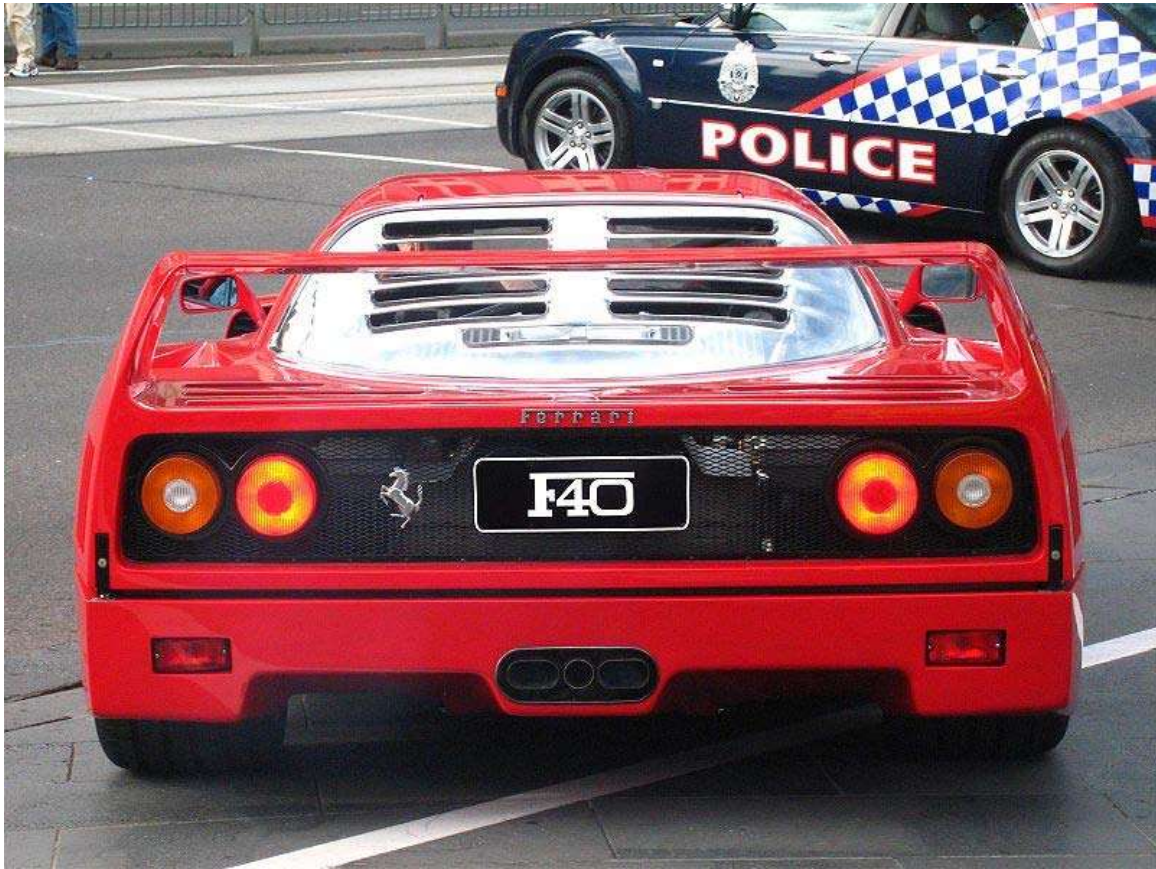
Rear view of a Ferrari F40 in Melbourne, Australia

The F40's light weight of 1,100 kg (2,425 lb) and high power output of 478 PS (352 kW; 471 hp) at 7000 rpm gave the vehicle tremendous performance potential. Road tests have produced 0–100 km/h (0–62 mph) times as low as 3.8 seconds (while the track only version came in at 3.2 seconds), with 0–160 km/h (0–99 mph) in 7.6 seconds and 0–200 km/h (0–120 mph) in 11 seconds giving the F40 a slight advantage in acceleration over the Porsche 959, its primary competitor at the time.