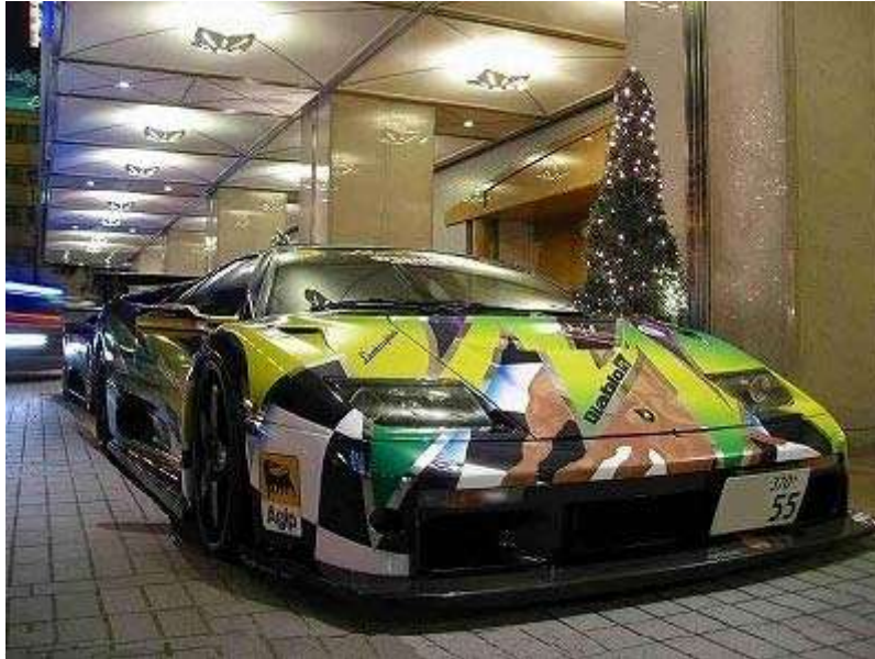
Lamborghini Diablo GT

The Diablo SE30 and its optional Jota upgrade kit had been quite sporty and race-oriented, but Lamborghini took this concept a step further in 1999 with its introduction of the very limited production Diablo GT, of which only 80 examples were produced for sale. The Diablo GT was a completely race-oriented trim differing in nearly every aspect from the more mainstream Diablos. With radically altered aggressive bodywork, a stripped-down interior, and an enlarged engine came a large price tag of nearly $300,000 and availability only in Europe, although some GT models were somehow imported into the US and possibly converted to road-legal US specification.