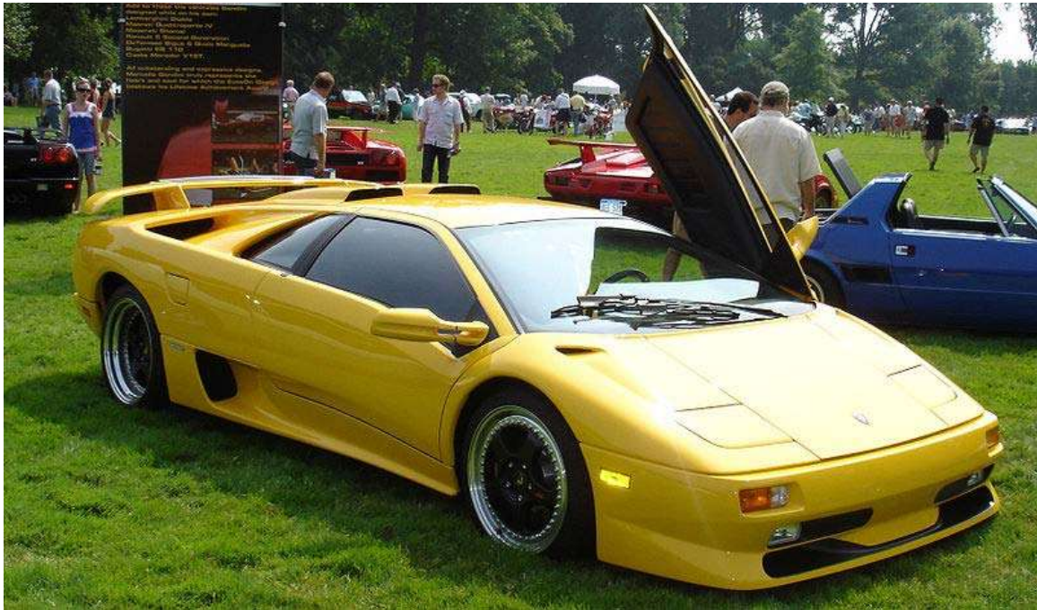
Lamborghini Diablo SV

The Diablo SV was introduced in 1995 at the Geneva Auto Show, reviving the super veloce title first used on the Miura SV. The SV was based on the standard Diablo and thus lacked the four-wheel drive of the VT. A notable feature of the SV was an increase in horsepower to 517 PS (380 kW; 510 hp), which, paired with the two-wheel drive layout, could cause loss of traction during hard driving. Interestingly, despite its higher power output, the SV was priced as the entry-level model in the Diablo range, falling below the standard Diablo by a small margin. An adjustable rear spoiler was installed as standard equipment and could be color-matched to the car body or formed from carbon fiber. Other exterior changes included black tail lamp surrounds, repositioned rear fog and reverse lamps as on the SE30, dual front foglamps (rather than the quad style found on all previous models), an extra set of front brake cooling ducts, a ducted engine lid similar to that installed on the Diablo SE30 Jota, and optional "SV" decals for the sides of the car. The SV also featured larger diameter front brakes (340 mm (13.4 in)) and a corresponding increase in front wheel size to 18 inches.