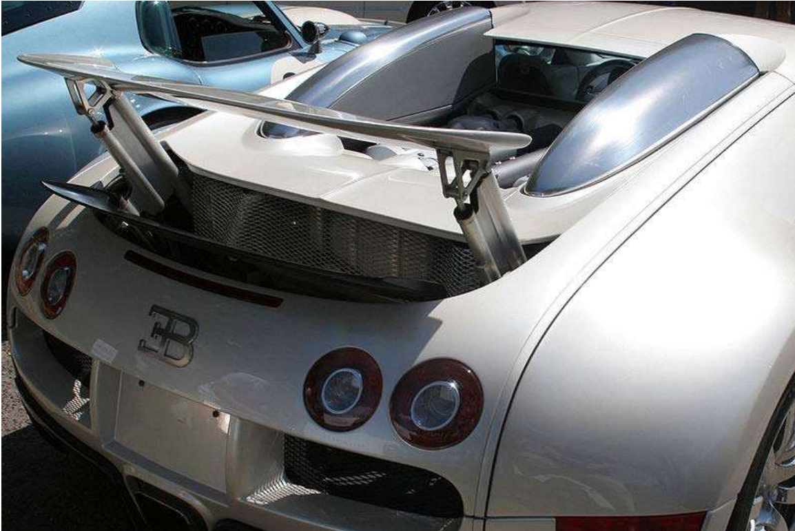
The Veyron's hydraulic rear spoiler in the extended position

The car's wheelbase is 2,710 mm (106.7 in). Overall length is 4,462 mm (175.7 in), width 1,998 mm (78.7 in) and height 1,204 mm (47.4 in).