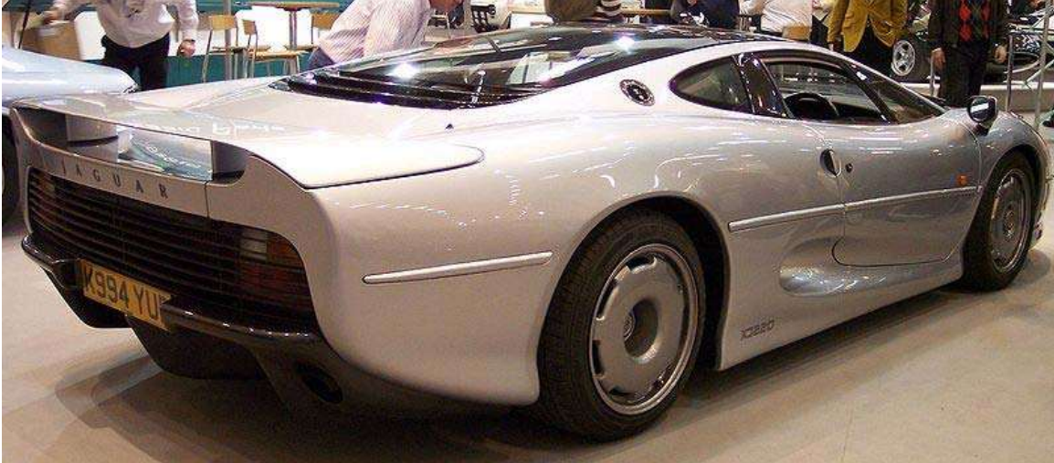
Rear three-quarters view of the XJ220

The prototype car was significantly heavier at 1,560 kg (3,439 lb) than other Jaguar racers like the XJR-9. But as it was intended to be, first and foremost, a roadcar, it would be more appropriate to compare it with something like the XJS; in spite of being 30-inch (762 mm) longer and 10-inch (254 mm) wider and even with the added weight of the all wheel drive system, the XJ220 was still 170 kg (375 lb) lighter than the XJS.