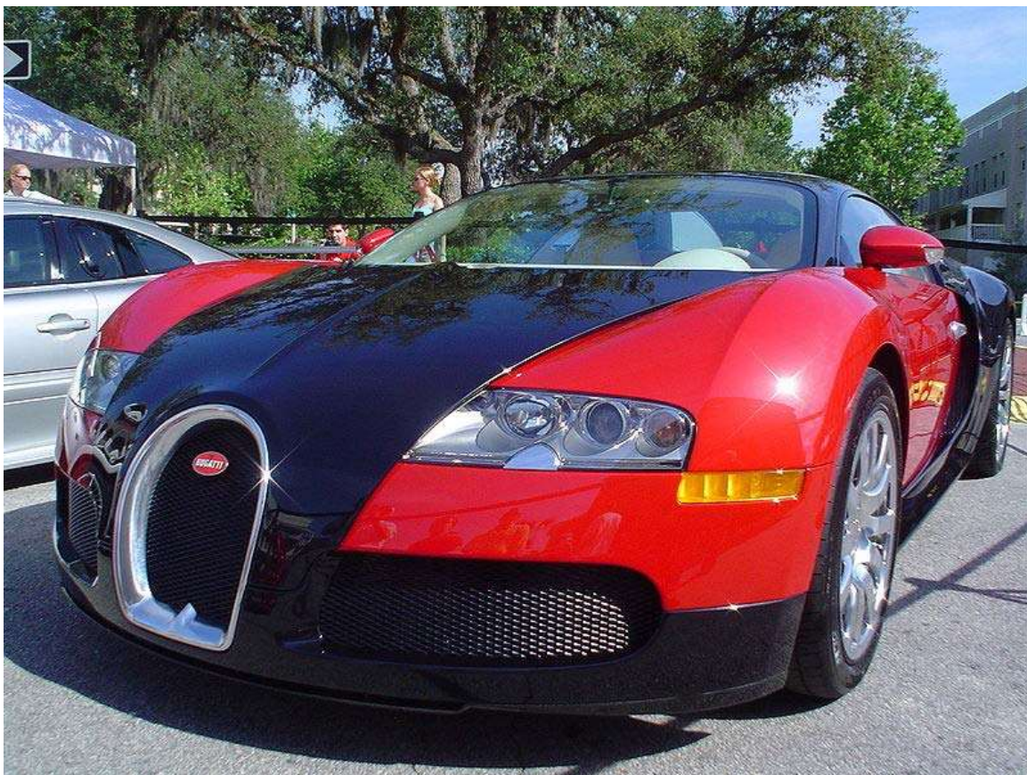
First US Bugatti Veyron on display in April 2006