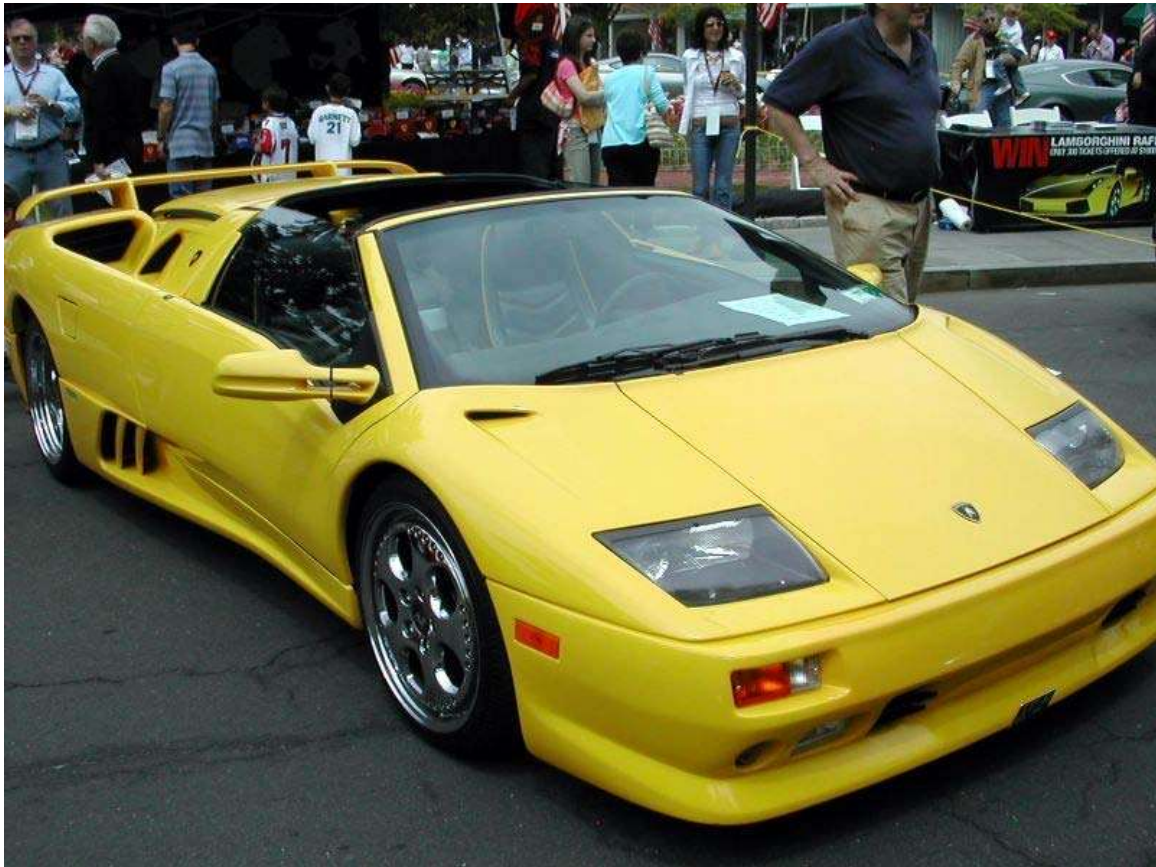
1999 Diablo VT Roadster, US-spec (note front fascia and rear brake ducts)

The second generation VT coupé and roadster received the same cosmetic and mechanical upgrades as the SV model, including the open headlamps, restyled interior, 537 PS (395 kW; 530 hp) engine, and ABS; little else was changed from the previous generation. All US-spec VT models, coupé and roadster alike, shared the same unique front and rear fascias as seen on the original VT Roadster, along with the vertical painted rear brake ducts that had debuted on the SE30 model; these cosmetic variations were available as options on rest-of-world VT coupés.