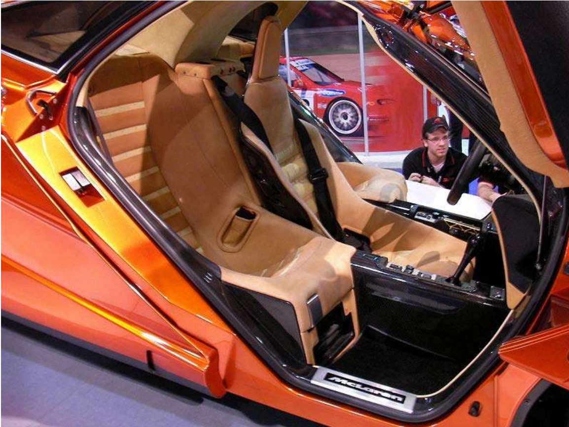
The three seat setup inside an F1.

Gordon Murray had been thinking of a three-seat sports car since his youth, but when Murray was waiting for a flight home from the fateful Italian Grand Prix in 1988; Murray drew a sketch of a three seater sports car and proposed it to Ron Dennis, pitched as the idea of creating the ultimate road car , a concept that would be heavily influenced by the Formula One experience and technology of the company and thus reflect that skill and knowledge through the McLaren F1.