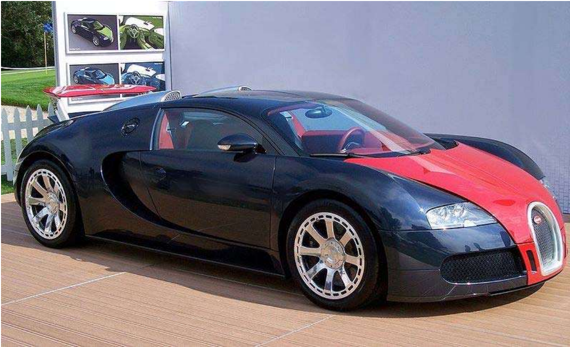
A Bugatti Veyron Fbg par Hermès