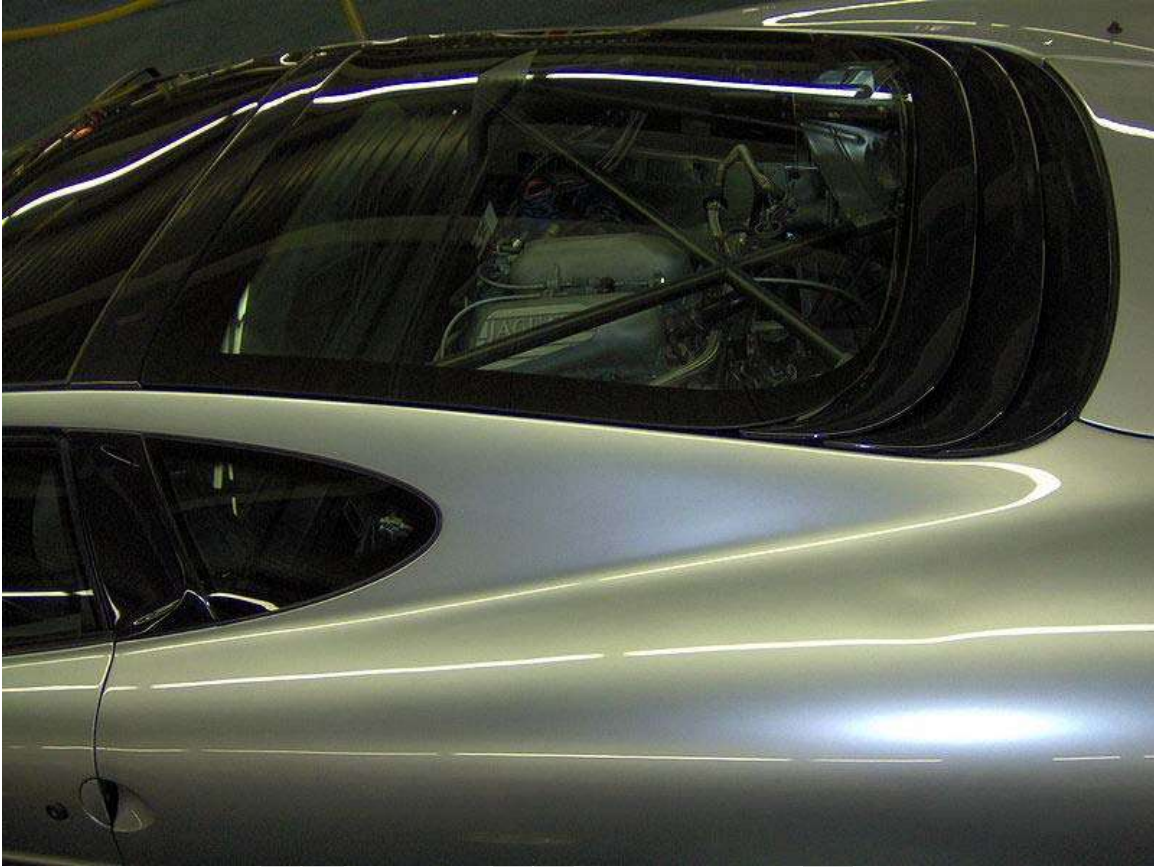
The XJ220's V6 engine is visible through the rear window

The production version of the car was first shown to the public in October 1991 after undergoing significant changes. The most obvious of which was a completely different drivetrain and the elimination of the scissor doors. TWR was charged with producing the car and had several goals/rules: the car would be rear wheel drive instead of all wheel drive; would have a turbocharged V6 engine instead of the big V12; and performance goals of over 200 mph (320 km/h), 0 to 60 mph (97 km/h) in 3.8 seconds, and the lightest weight possible.