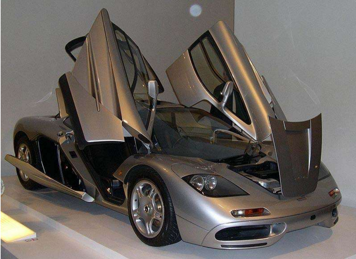
Standard McLaren F1 with all user accessible compartments opened.