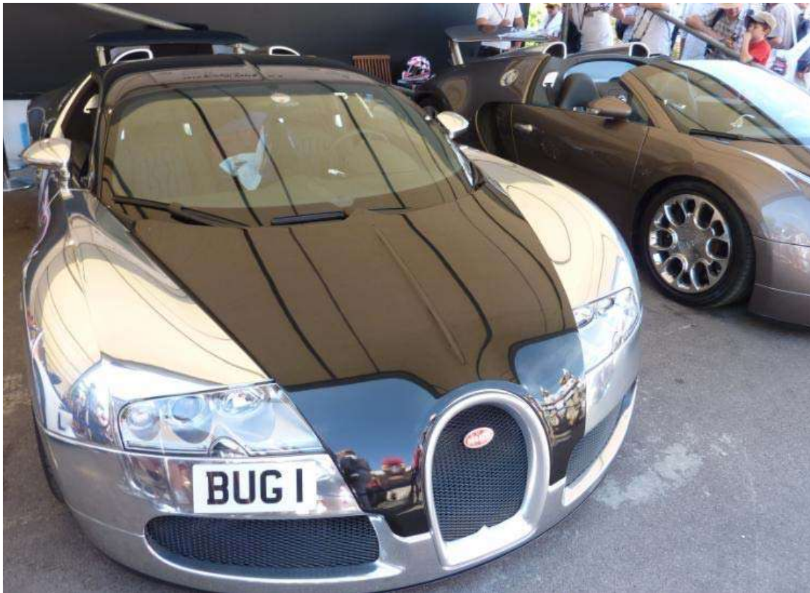
A chrome Veyron in the UK

German inspection officials recorded an average top speed of 408.47 km/h (253.81 mph) during test sessions on the Ehra-Lessien test track on 19 April 2005. On 4 July 2010, Bugatti's official test driver Pierre Henri Raphanel piloted the Super Sport edition and was clocked at an average of 431.072 km/h (267.856 mph) on the same track, taking back the title from the SSC Ultimate Aero TT as the fastest production vehicle of all time. The 431.072 km/h mark was reached by averaging the Super Sport's two test runs, the first topping out at 427.93 km/h (265.90 mph) and the second at 434.20 km/h (269.80 mph). The record run was certified by the German government and the Guinness Book of World Records.