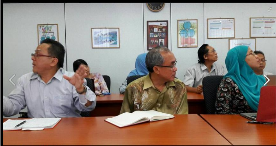
Photos from Office of Deputy Vice-Chancellor (Research and Innovation)'s post in Mobile Uploads