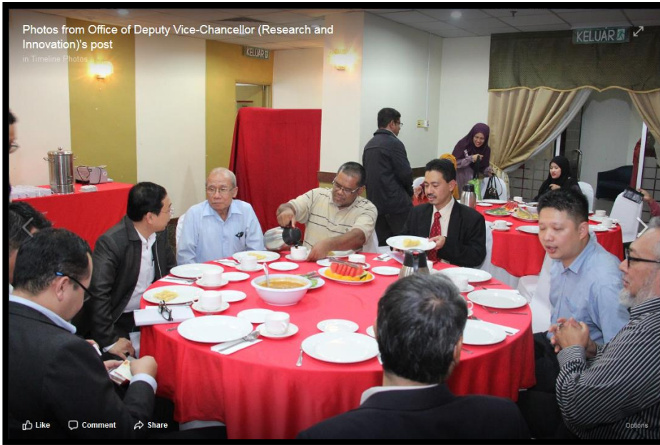
Photos from Office of Deputy Vice-Chancellor (Research and Innovation)'s post in Timeline Photos